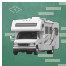
RVs & Motorhomes