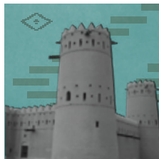
Preservation Of Environment & Cultural Heritage