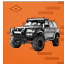
Outdoor Leisure Vehicle & Equipment