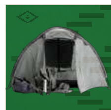
Hunting & Camping Equipment