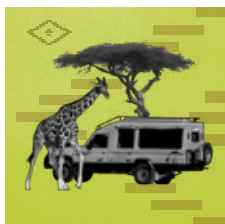
Hunting Tourism & Safari