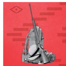
Hunting & Shooting Sports Guns & Equipment