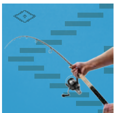
Fishing Equipment & Marine Sports